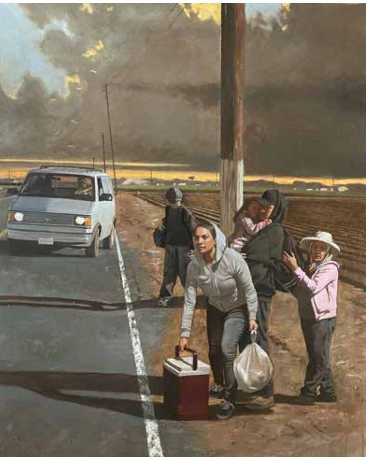
1 Invisible People (study), oil on panel, 10 x 8"

In 1952, Ralph Ellison published his novel, Invisible Man , a first-person narrative of a Black man in a racially divided world that doesn't recognize him as a human being. The cover for a 1953 edition of the book was painted by James Avati, a composition in which a Black man observes a multitude of bustling white people who are oblivious to his presence.