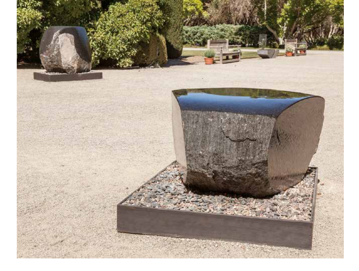
Filoli Group Exhibition 2014 ABOVE, FAR LEFT Emergence. Granite fountain, 54' high. ABOVE AND RIGHT Harmony. Granite fountain. 5' wide. BOTTOM ZigZag. Granite bench, 80" long.