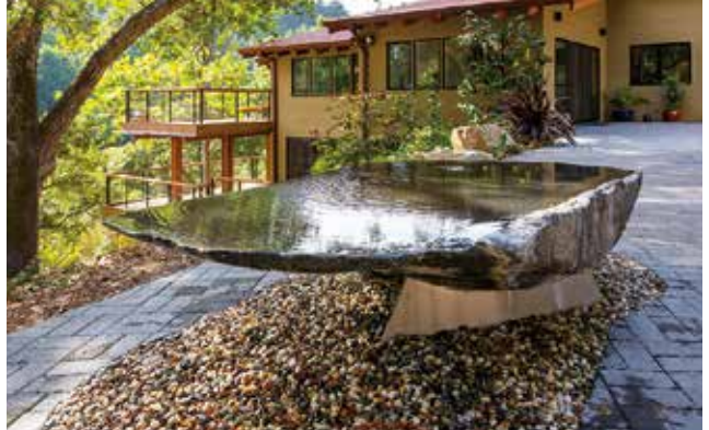
The mineral kingdom is the great architect. It forms the land and gives structure to our bodies. The Japanese consider stone to be the most important element in garden design.