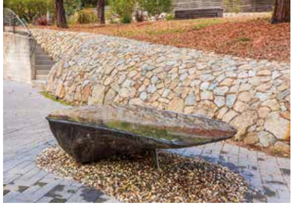
Marcellino Residence 2013 Design and installation of one-acre hillscape TOP AND ABOVE Woven sculptural fence, 250' long; sculptural granite wall, 60' long; Cantilever, granite fountain, 7' long.