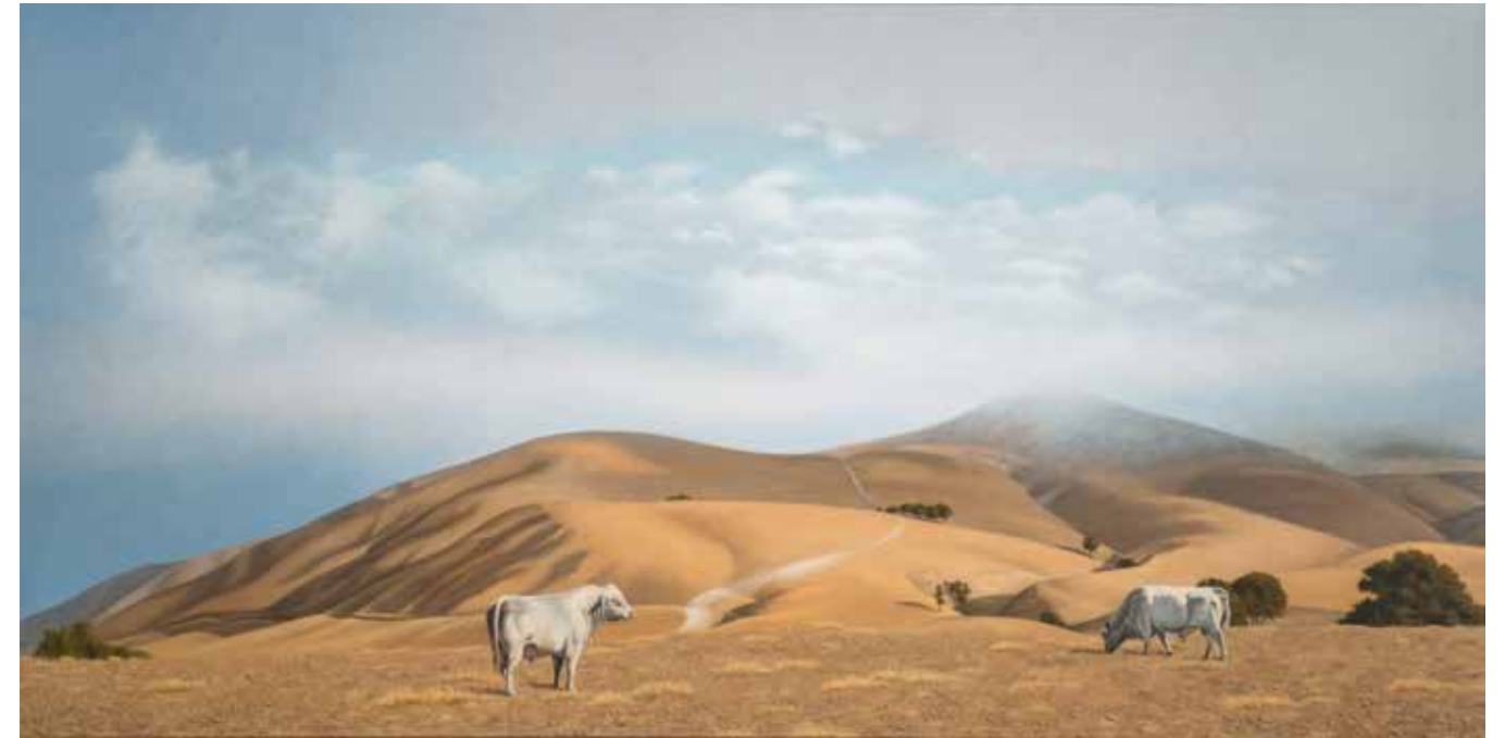
This Page: Two White Bulls , Acrylic on Panel, 24 x 48 inches Front Cover: Light , Monoprint with Collage, 22 3/4 x 22 inches Back Cover: White Bull , Acrylic on Panel, 30 x 24 inches

This catalog is published by Winfield Gallery Publication © 2015 Winfield Gallery All rights reserved. No part of this catalog may be reproduced without the written permission of Winfield Gallery Design by Stephanie Workman/Red Dot Media