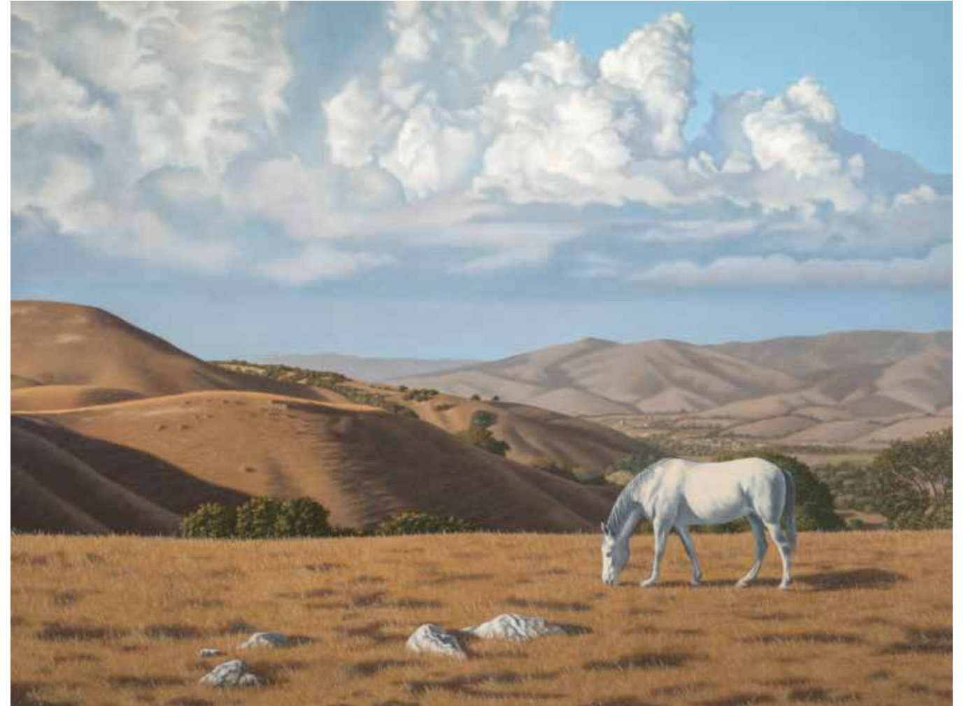
Mona Lisa , Acrylic on Panel, 30 x 40 inches