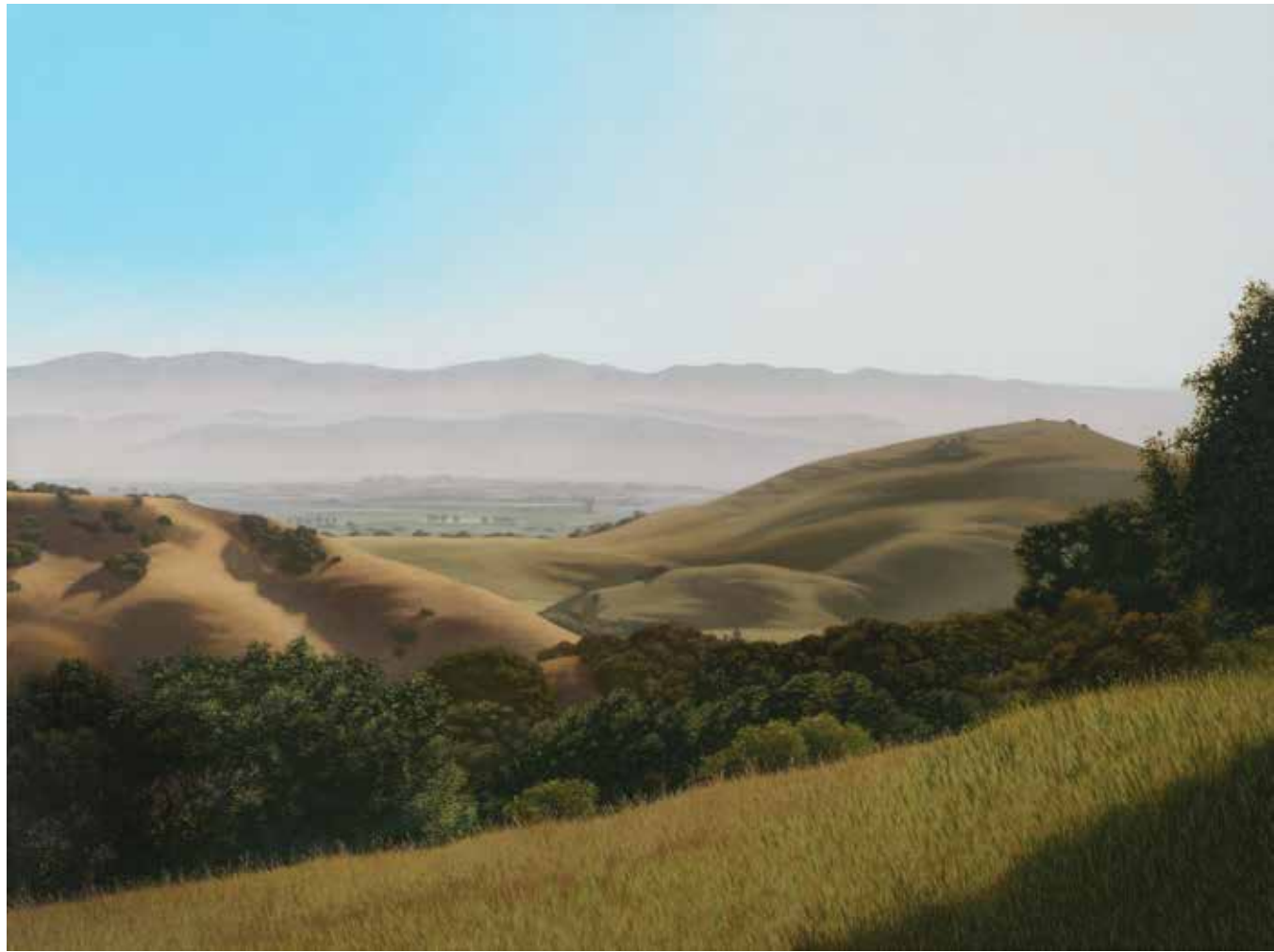
View from Fort Ord , Acrylic on Panel, 30 x 40 inches