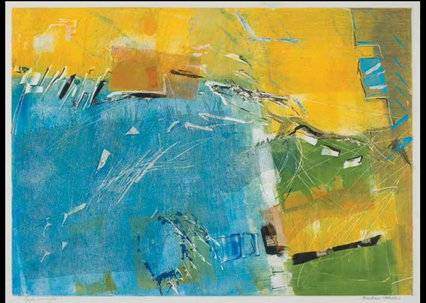
Early Sunlight , Monoprints with Collage, 16 1/2 x 22 1/2 inches