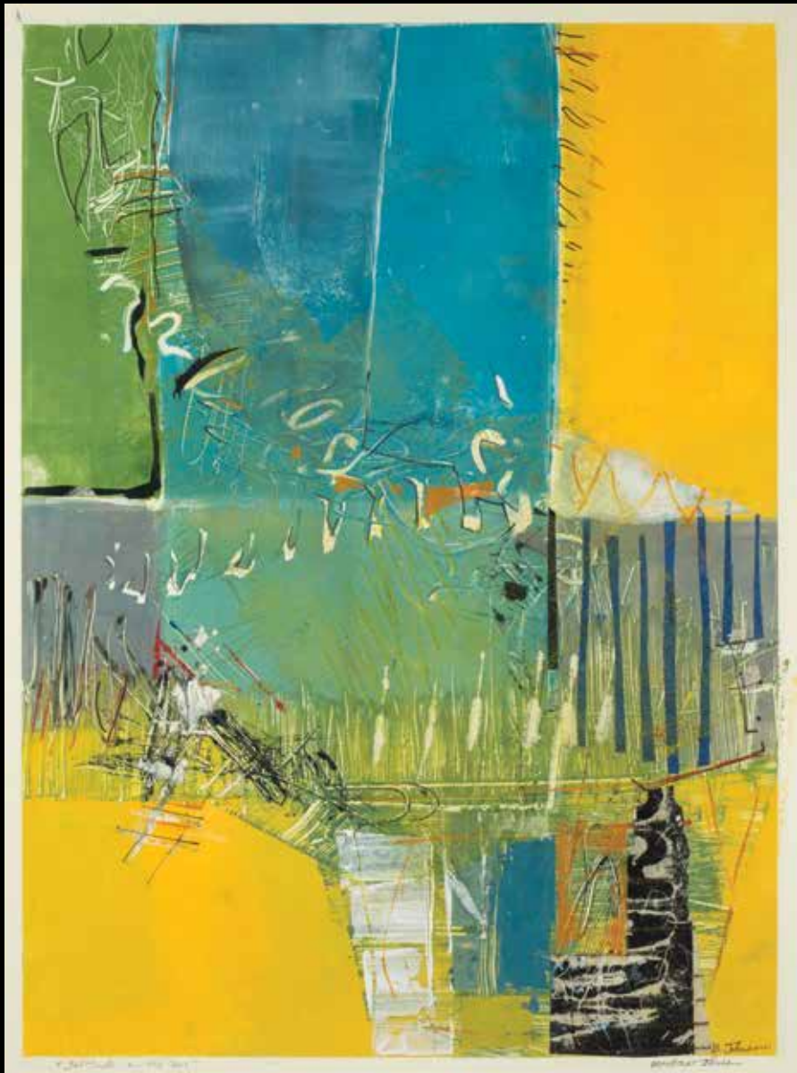
Solitude On The Bay , Monoprint with Collage, 20 1/2 x 16 1/2 inches