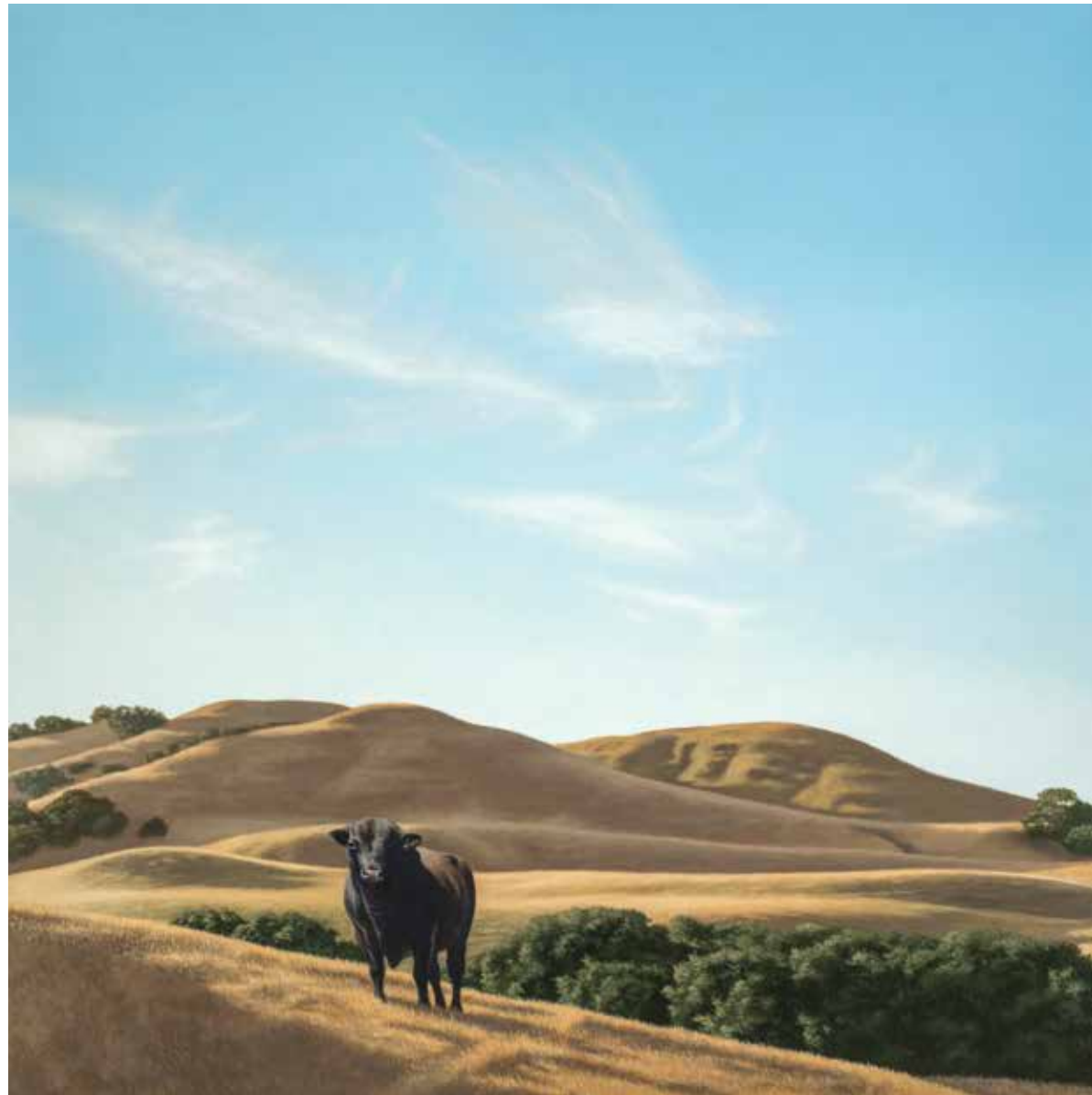
Black Bull , Acrylic on Panel, 24 x 24 inches