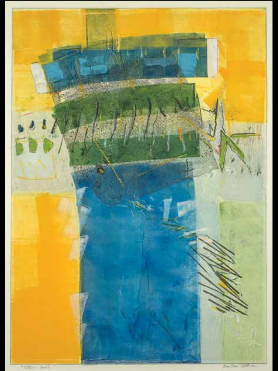
Nature Trail, Monoprint with Collage, 23 x 16 3/4 inches