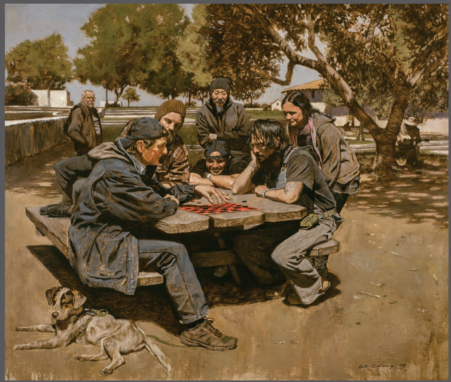
Checkers, 34 x 40 inches, oil on canvas, 2014, Private Collection