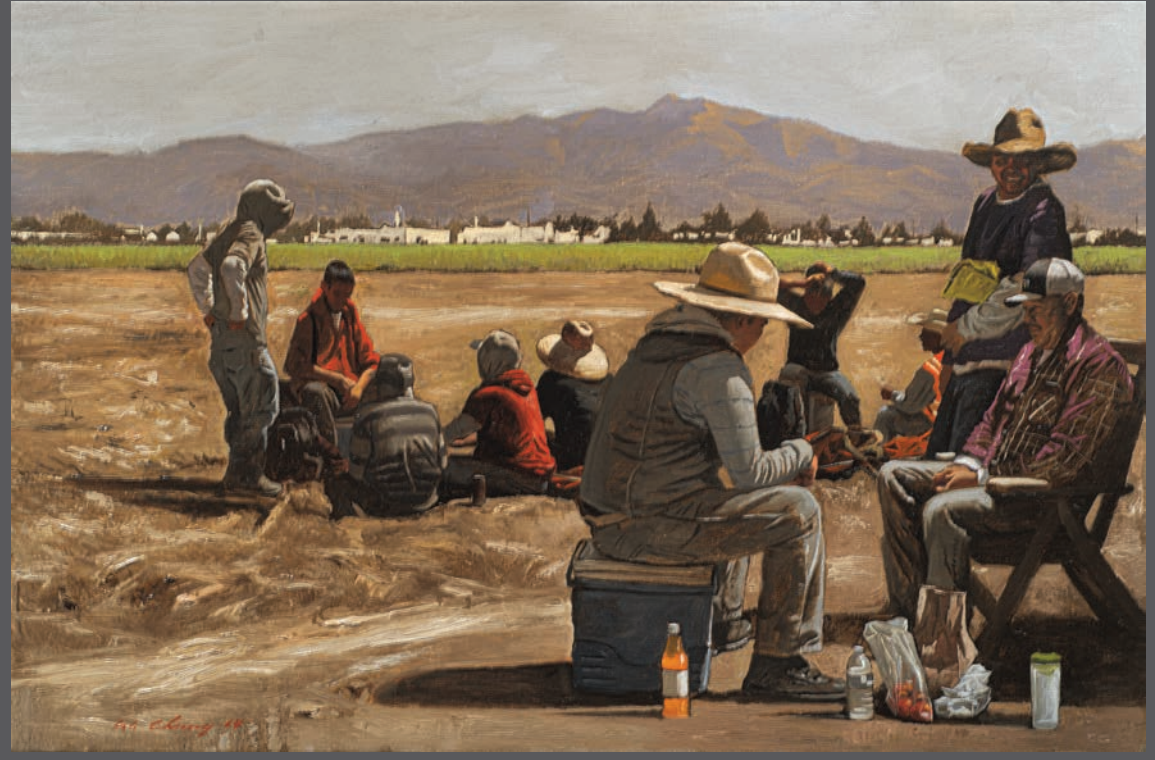
Drawin into the Light, 16 x 24 inches, oil on canvas, 2019