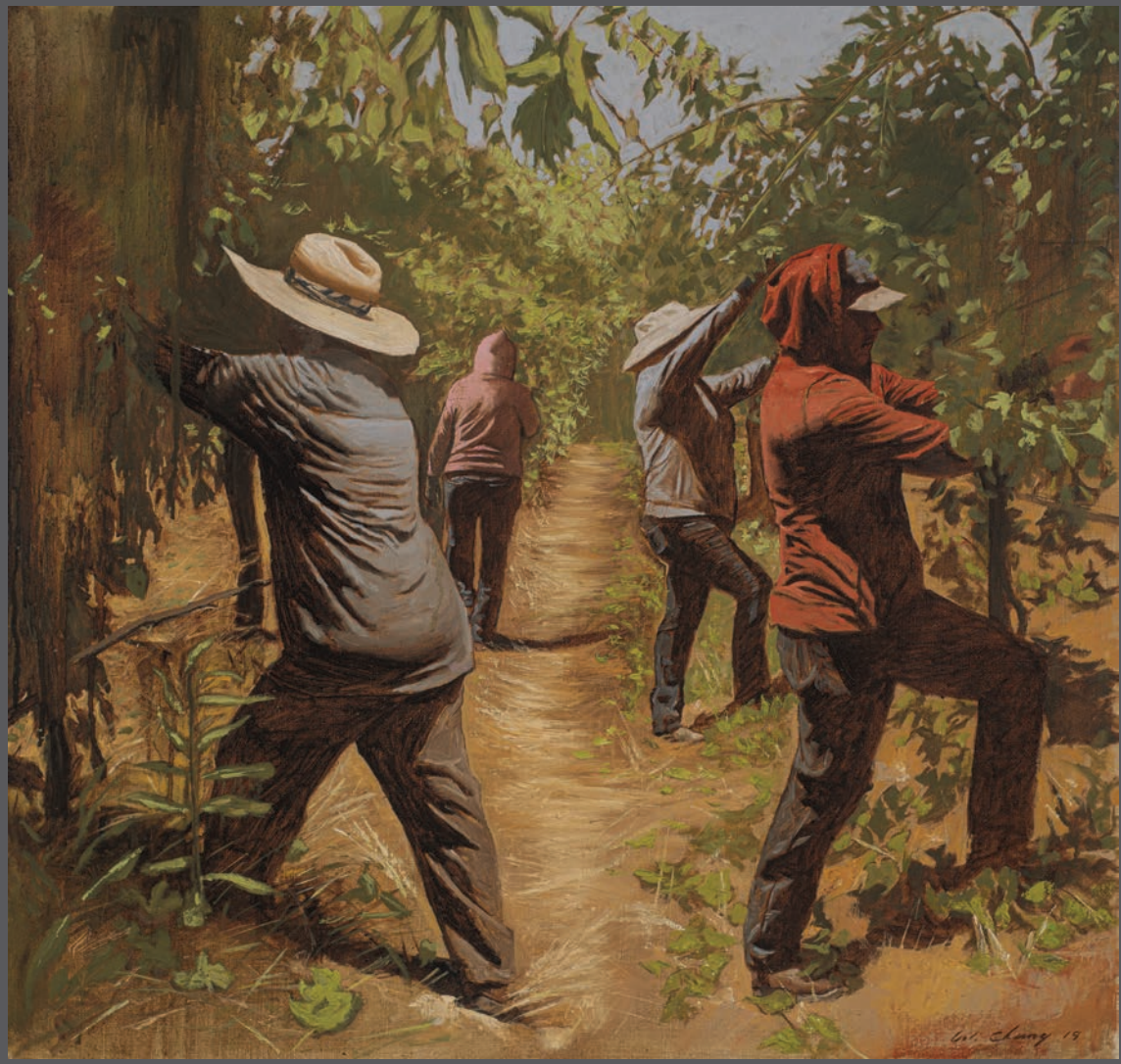
Pulling Leaves, 20 x 24 inches, oil on canvas, 2019