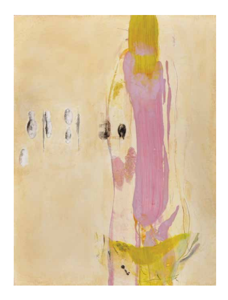
Lumenis 16. Encaustic Monotype, Acrylic Glazes, Cold Wax on Panel, 24 x 18, 2013