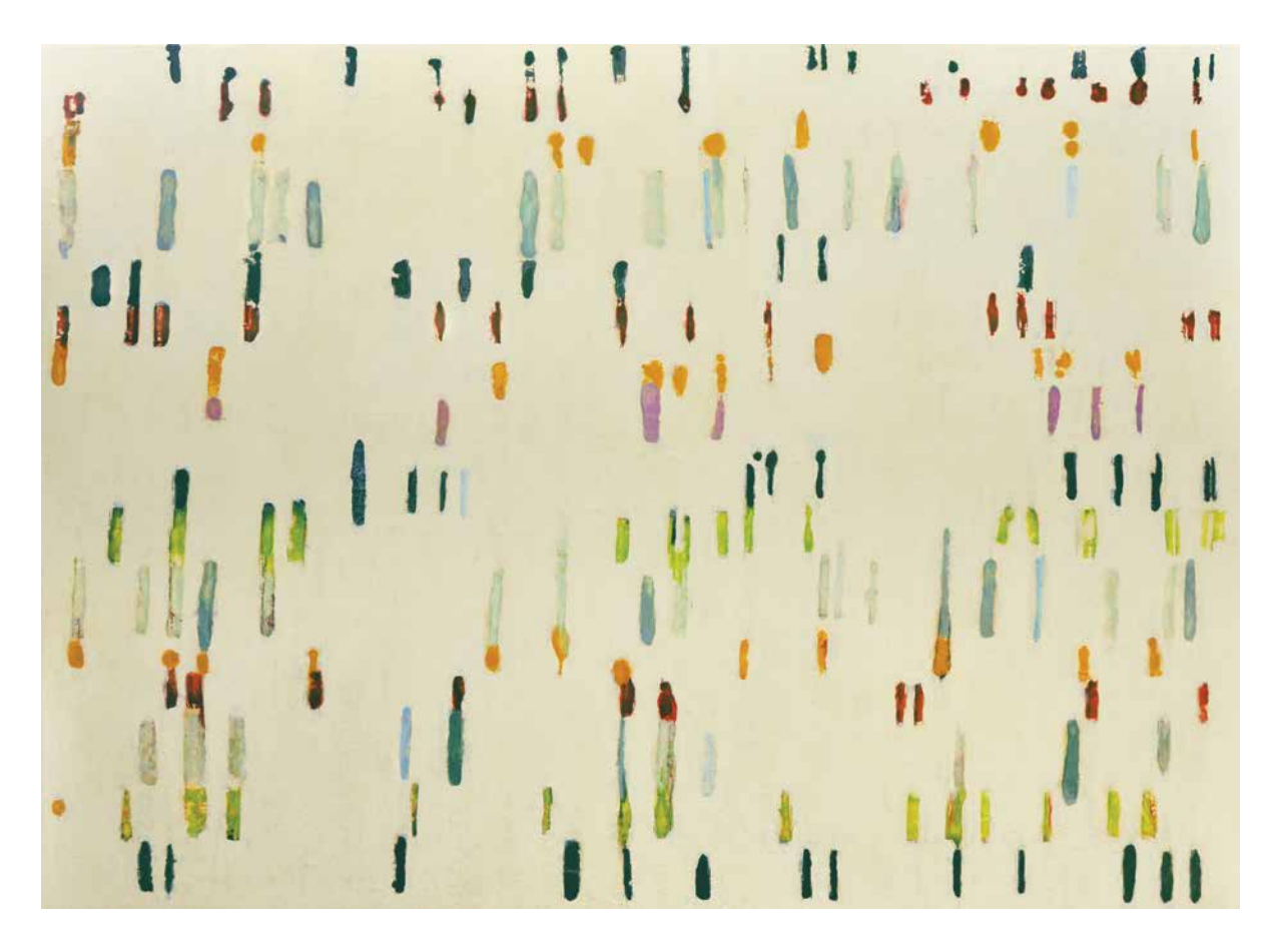
Lumenis 9. Encaustic Monotype, Acrylic Glazes, Cold Wax on Panel, 39 x 54, 2013