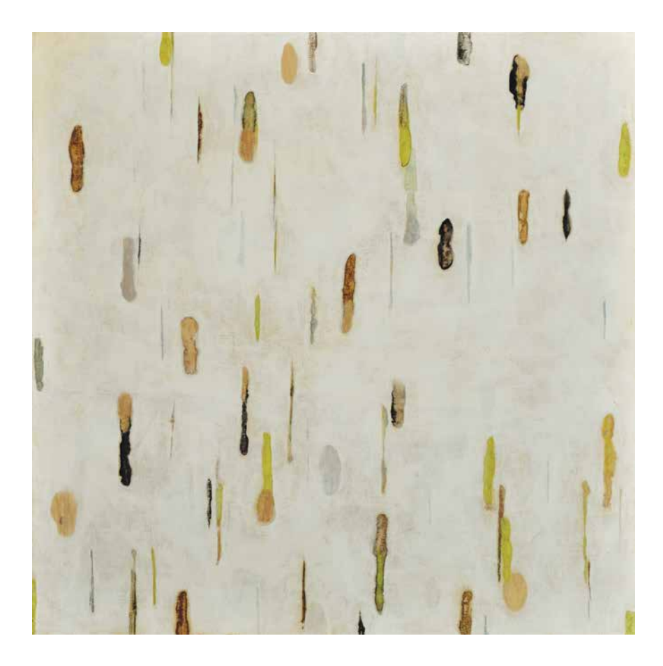
Lumenis 12. Encaustic Monotype, Acrylic Glazes, Cold Wax on Panel, 36 x 36, 2013