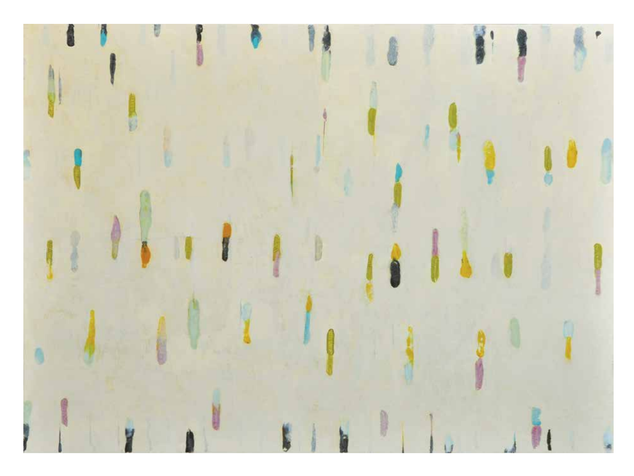
Lumenis 10 . Encaustic Monotype, Acrylic Glazes, Cold Wax on Panel, 39 x 54, 2013