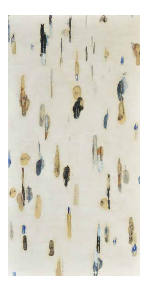
Lumenis 13. Encaustic Monotype, Acrylic Glazes, Cold Wax on Panel, 43 x 22, 2013