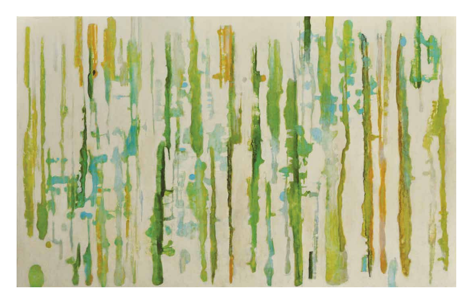
Lumenis 7. Encaustic Monotype, Acrylic Glazes, Cold Wax on Panel, 32 x 52, 2013